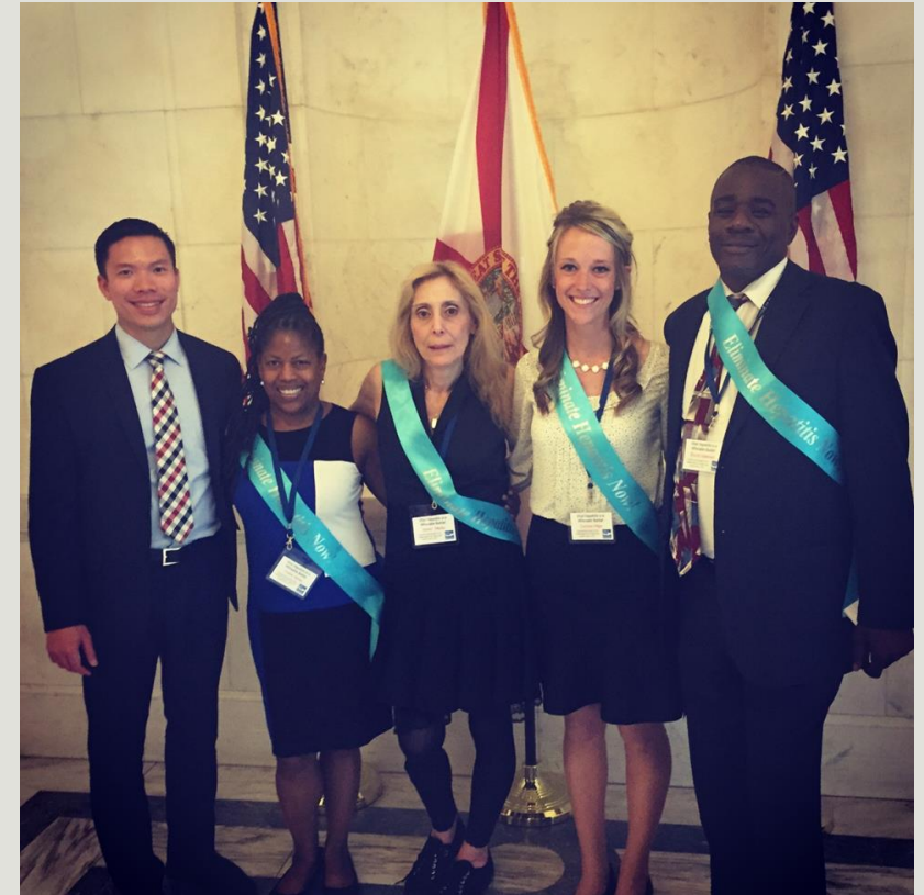
Caring Ambassadors Advocates Unite, NYS Advocates: (Washington DC May 2015)