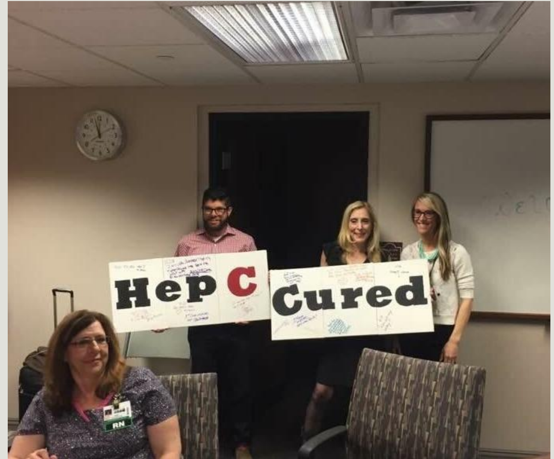
Second Annual HCV cure Party held in Buffalo, NY May 2017